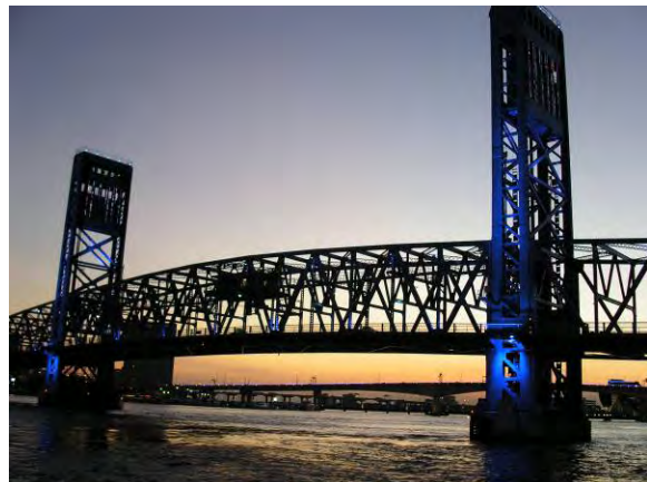
Main Street Bridge, over the Saint Johns River Jacksonville, FL.

There will also be training sessions, concurrent sessions and plenty of time for networking with fellow MRC leaders. Hope to see you there!