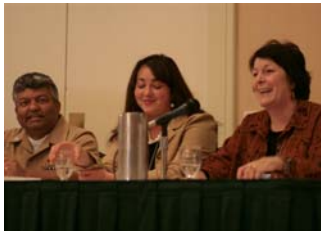
Hurricane Response Panel