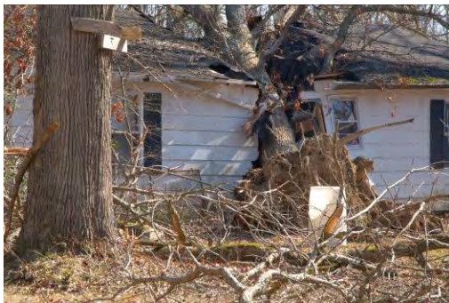
Damage from the KY Winter Storm – Photo courtesy of FEMA Photo Library

Beginning on January 27, a winter storm swept through Kentucky, leaving a path of damage in its wake that eventually led to one hundred counties receiving emergency declarations from FEMA. The storm caused the largest power outage in the state's history, with well over half a million homes without power. Medical Reserve Corps volunteers assisted with shelters across the